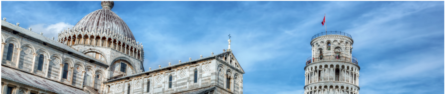
Curioso E Jubilante - LDA